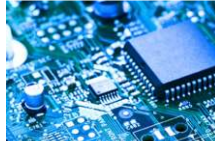
| Batteries / Electronics