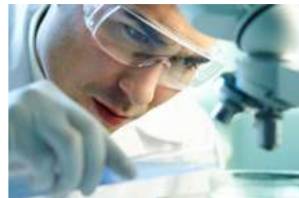
| Research / University