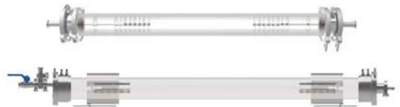
Examples of work tube packages