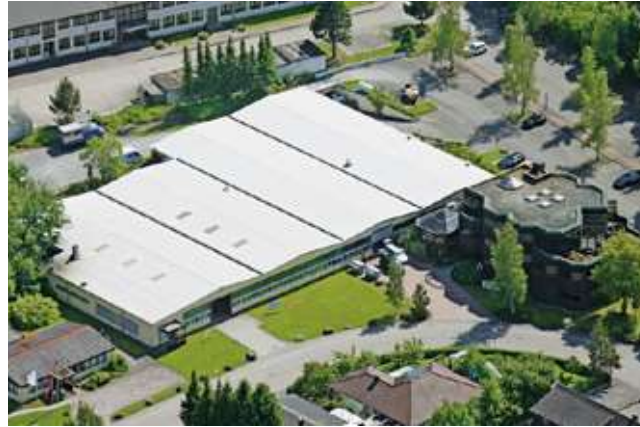
Carbolite Gero, Neuhausen/Germany

All products, and more, featured in this catalogue are available through your local Carbolite Gero office, Verder Scientific office or an extensive network of 3rd party dealers and sales organisations.