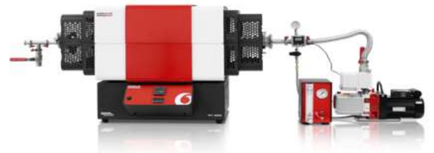
TF tube furnace combined with the Rotary vane pump package and vacuum work tub package