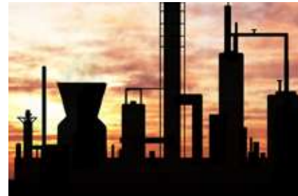
| Coal / Power plant / Energy