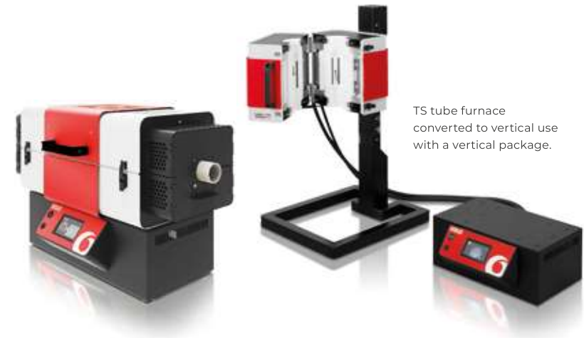
TS tube furnace converted to vertical use with a vertical package.

Combining a vacuum pump package with a work tube vacuum package offers a complete solution for horizontal tube furnaces. Please contact Carbolite Gero for assistance.