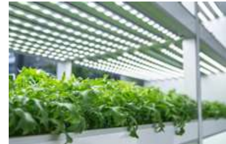
| Food / Feed