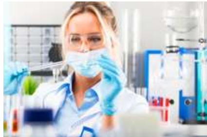
| Chemistry / Plastics