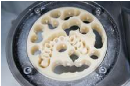
| Ceramics / Glass