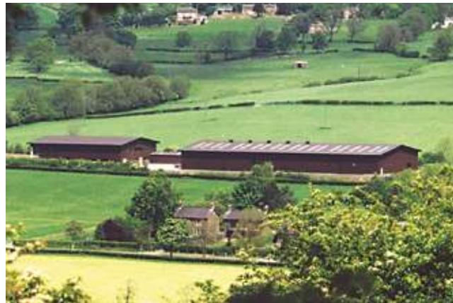
Carbolite Gero, Hope/United Kingdom