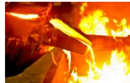
| Steel / Metallurgy