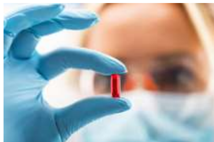
| Medicine / Pharmaceuticals